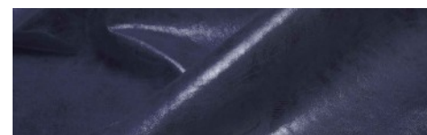
MAX F571 H