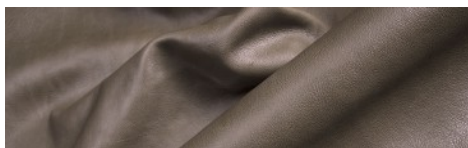
CAPUA F772 H